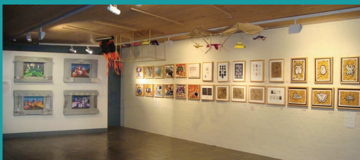
Intermediate students art works "Inspired by da Vinci".