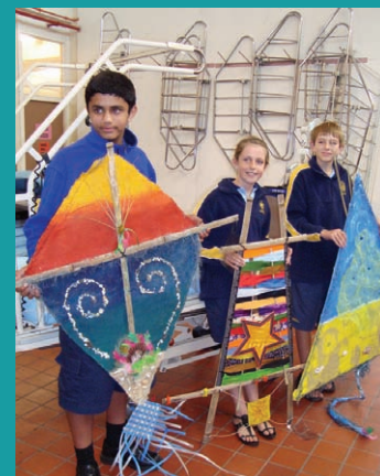
Art work donated to Waikato Hospital