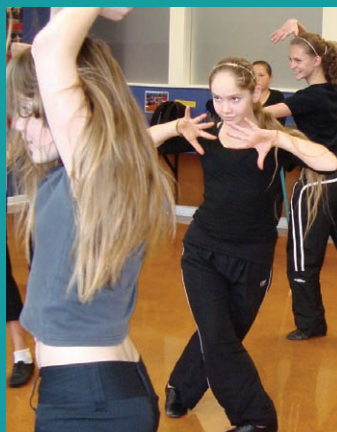
All smiles at Inter-intermediate dance day

The Arts Waikato education advisors are now working on sharing the success of the intermediate arts days with clusters of full-primary schools. The possibilities are endless and the outcome can only be positive and rewarding for all those involved. To learn more contact kerrie@artswaikato.org.nz or wanda@artswaikato.org.nz