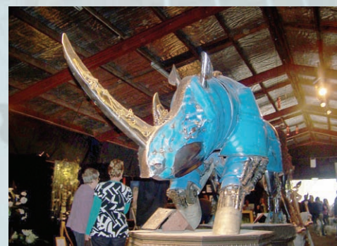
Boris the Blue Behemoth sculpture by Marty Wong